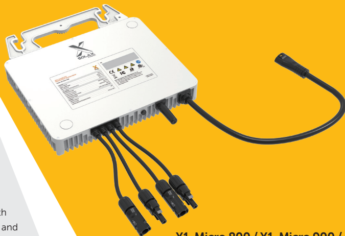
X1-Micro 800 / X1-Micro 900 / X1-Micro 1000 / X1-Micro 1200

The SolaX X1-Micro series is renowned for its exceptional power output, positioning itself as one of the top-rated models among 2-in-1 microinverters, boasting an impressive capacity of up to 1200 VA. Specifically designed to cater to the latest and previous generation of high-power modules, these microinverters feature two independent MPPTs and robust support for input current and output power. Seamlessly incorporating Wi-Fi wireless technology, the X1-Micro series ensures reliable and consistent communication, offering users a smooth monitoring and control experience. Delivering a cost-effective solution, these microinverters are highly suitable for both residential and commercial solar applications. Furthermore, they are fully compatible with the SolaX Hybrid system and seamlessly integrate with various AC coupled systems available in the market, thus enhancing their versatility and adaptability.